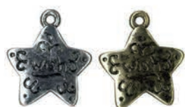
Wish on a Star

{ Grab a friend, share a bottle and a laugh, create something new, make a memory! }