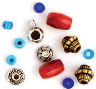
Semi-precious and metal beads