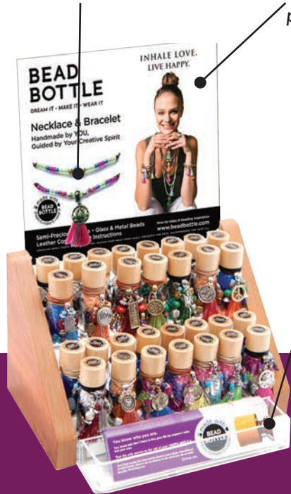
30 Bottle Display 9.5" L x 10" W x 13.25" H

Themed Heading-see Billboard page for more options