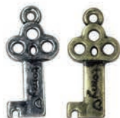
Key to my Heart