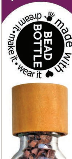
Product Card Front

You know who you are. You don't have to live by anyone's rules but your own, and the only answer to the call of your creative spirit is YES! Inside this tiny bottle there's more than a handful of beads; there's an invitation to be your amazing self. Shine on.