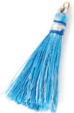
Silk Tassel available on request