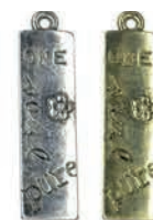
One Soul Pure