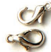
Lobster Closures (2)